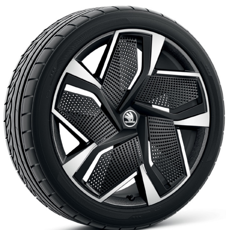
21" 'Vision' Anthracite metallic alloy wheels

The colour range also includes Energy Blue (not shown).