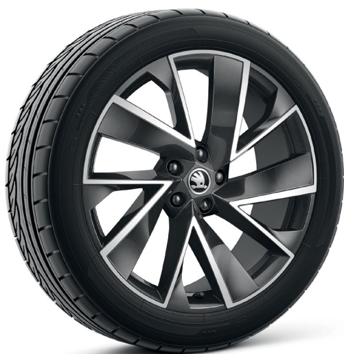
20-inch 'Vega' Anthracite metallic alloy wheels